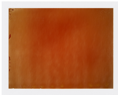
Wavy Sunset, 2017, 11 cm x 8,8 cm

The sea cannot be contained, only when we dare to put a frame on it... -- Suffo Moncloa